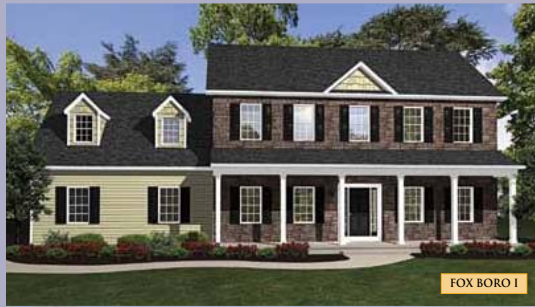
FOX BORO I

Icon Legacy Custom Modular Homes manufactures energy efficient homes, commercial projects, multi-family projects, and assists in the development of residential subdivisions and 50+ retirement communities throughout the east coast, which meet or exceed all state and local codes. Our design and build capabilities encompass the full realm of construction from the smallest ranch to the largest two story, condo, duplex, or townhouse.